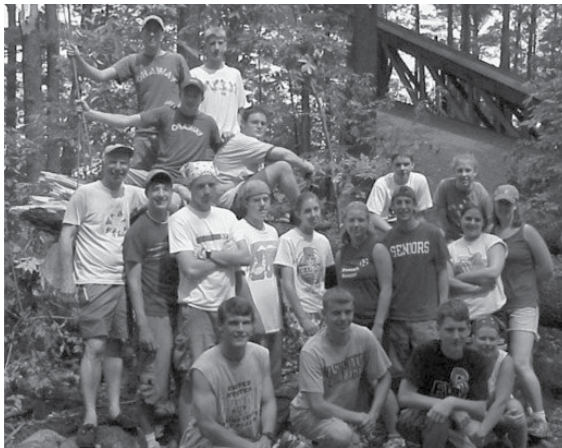
Sap covered staff members amidst storm damage (2001).

Registration forms and more information at bgbrigade.com under Onaway schedule.